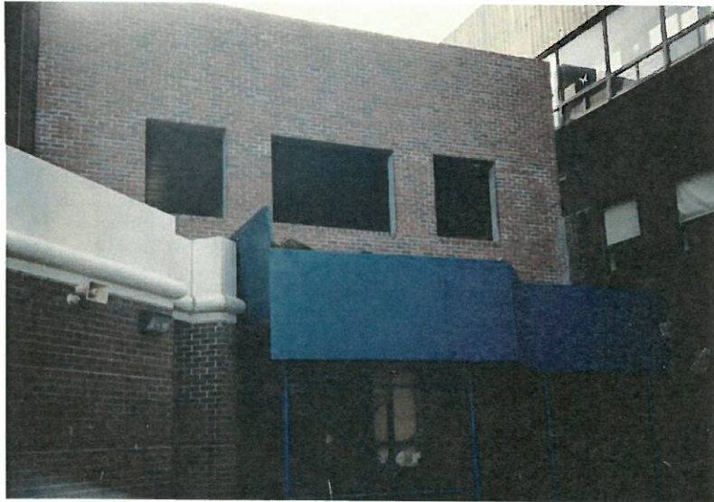
Compiled by K.Marames