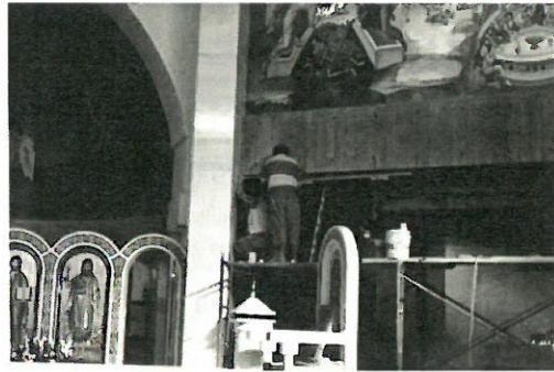
Preparing the wall for the marble