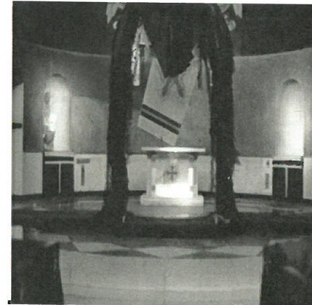
The cement iconostasion is removed make way for the marble from Italy.

By 1985, St. Nicholas began Phase II of the building program to complete the interior of the Church and prepare for its Consecration. A new altar, icon screen, baptistery, new carpeting, choir loft, three new classrooms, a new meeting room and a reliquary for the relics of St. Nicholas were included in the final plans. Italian artisans, under the direction of Salvatore Bruno of Carrara, Italy, were brought to Flushing, to execute the mosaics and the marble work, some of which was imported from the same quarry used by Michelangelo. The Church was consecrated on June 4, 1989.